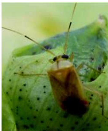
Mirid bug on cotton

Though debatable, it is also one of the possibilities that, since the donor parent Coker 312 is known to be highly susceptible to sucking pests such as jassids and thrips, the hybrids may be showing slightly enhanced susceptibility to these pests due to linkage drag, especially if the recurrent parent did not possess inherent resistance to the sucking pests.