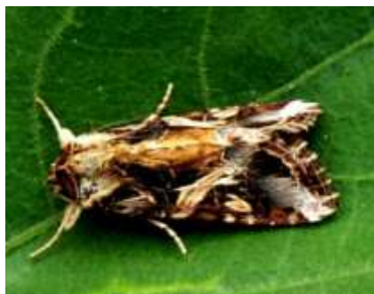
Spodoptera litura moth

The Bt-cotton with Cry1Ac is only moderately toxic to the leaf eating caterpillar Spodoptera . Bollgard-II has Cry2Ab which expresses at high levels, and has better control efficacy, compared to the Bt-cotton with only cry1Ac gene. However, considering the moderate toxicity of Cry1Ac and Cry2Ab to Spodoptera litura , it is likely that the pest may be able to feed and survive on Bollgard II in the next few years. It would not be surprising to see that farmers in some parts of the country would find Spodoptera on Bt-cotton.