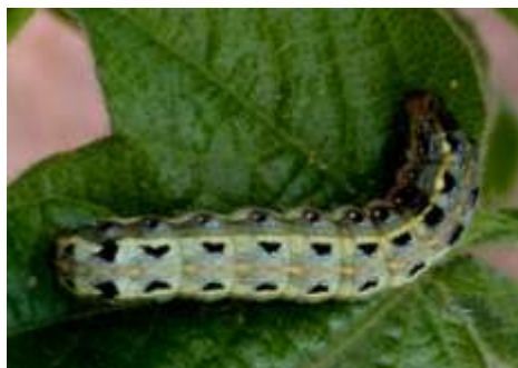
Spodoptera litura larva