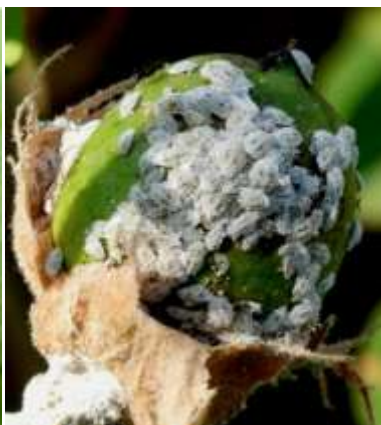
Mealybugs on cotton boll

It is known that the usage of synthetic pyrethroids for bollworm control had significant negative impact on the incidental populations of Spodoptera spp. and several other miscellaneous bugs including the mirid bugs, Creontiodes biseratense (Distant), Ragmus sp. The reduction of pyrethroids and several conventional insecticides on Bt-cotton is presumed to have led to an enhanced infestation of several non-target