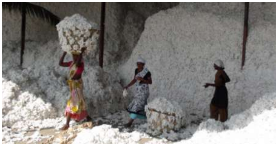
Indian Markets with surplus cotton

India became a leading global exporter of raw cotton with exports averaging at 53 lakh bales over nine years from 2003-2011 compared to an average of 1.18 lakh bales during the years 1997 to 2002 prior to the introduction of Bt cotton. Imports declined from an average of 16.50 lakh bales over 6 years between 1997 to 2002, to an average of 6.9 lakh bales over 9 years from 2003 to 2011.