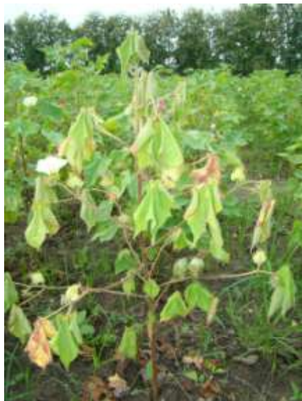
parawilt affected plant

Right from the inception of the technology there has been a sustained opposition from some of the NGO groups. The initial opposition was very speculative and confusing without any reasonable assessment of the technological strengths of Bt-cotton. Most of the criticism was also based on plain ignorance. The Karnataka Ryta Sangha conducted public demonstrations against Bt-cotton and uprooted a few Bt-cotton experimental plots in 1998 and 1999 with misleading accusations of the possible presence of the 'terminator' genes in Bt-cotton. Later several NGOs started highlighting crop failures as failure of Bt-cotton technology. Clearly crop failures resulting from either abiotic or biotic stress, were being attributed to Bt-technology, ignoring the fact that Bt-cotton was developed specifically to offer protection against bollworms, not against any other adverse factors.