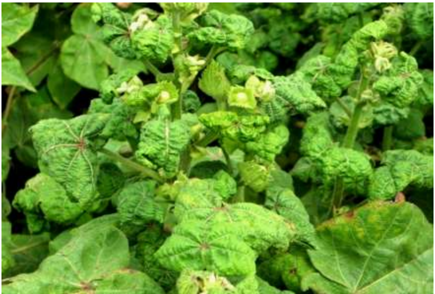
Leaf curl virus infected plants in north India

It is true that the soils of Punjab, Haryana and Rajasthan are fertile and highly suited for cotton cultivation. However, the major problem with north India is the unsuitability of hybrids for the region. The high levels of soil fertility and excessive irrigation allow the hybrids to express vigour in the form of excessive vegetative growth, which does not actually translate into high yields and nutrients are wasted.